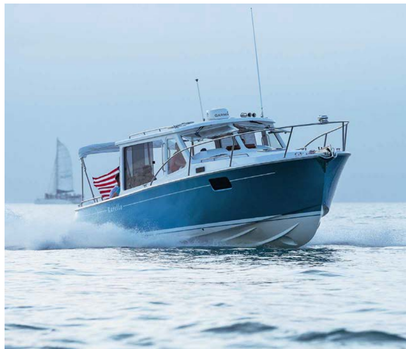
Fast, fun, and best in class sports car handling