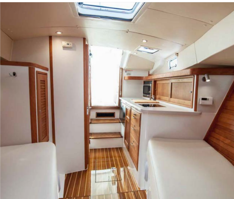
Corian solid surfaces throughout

High-performance luxury outboard day-yacht, ideal for a day on the water with friends and family, entertaining, and weekend cruising. Amazing shoal draft capabilities and the best family dayboat under 40-feet. Drive a 35 and get to know the responsive power and stability of her hull and the open layout that brings the party together.