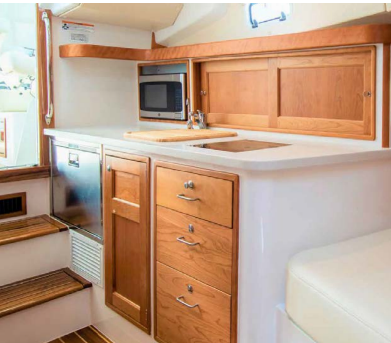
Beautiful above and below cabinet storage

Classic destroyer wheel and a modern helm layout accented by a solid teak companionway hatch. A full galley with plenty of counter space, refrigerator, and cooktop.