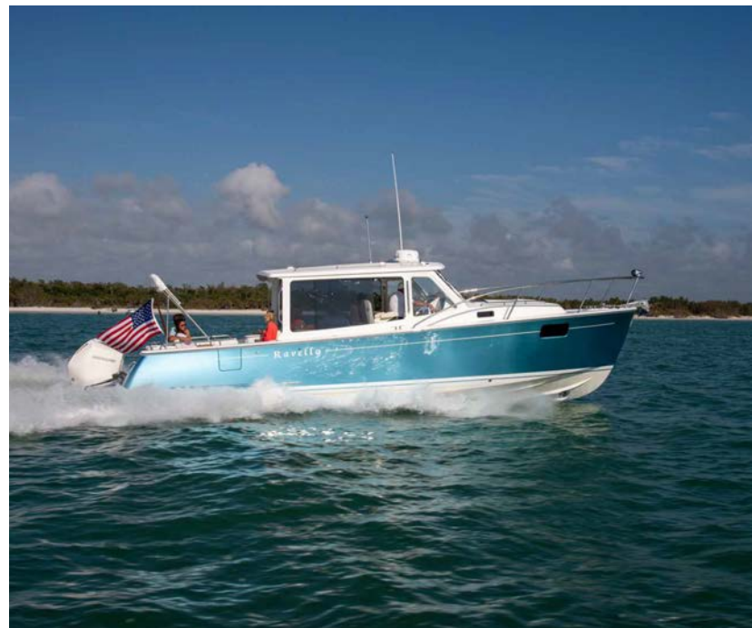
Comfortable ride at a top speed of 50 MPH